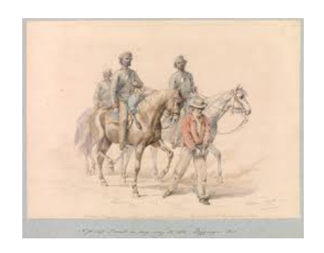
Indigenous and 'black' troopers arresting a 'white' prisoner

- the words 'After Australia' and 'white supremacy' clearly led me to believe that I, as a 'white Australian', was being racially vilified by 'defacement' by the publishers.